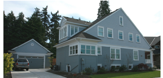
Right: Logan House