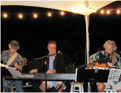
Enjoy the sounds of Island Trio