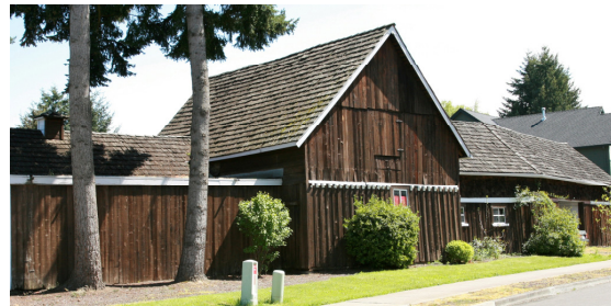
Left: Jurgens Barn