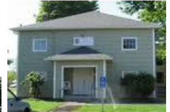
Right: Winona Grange Hall